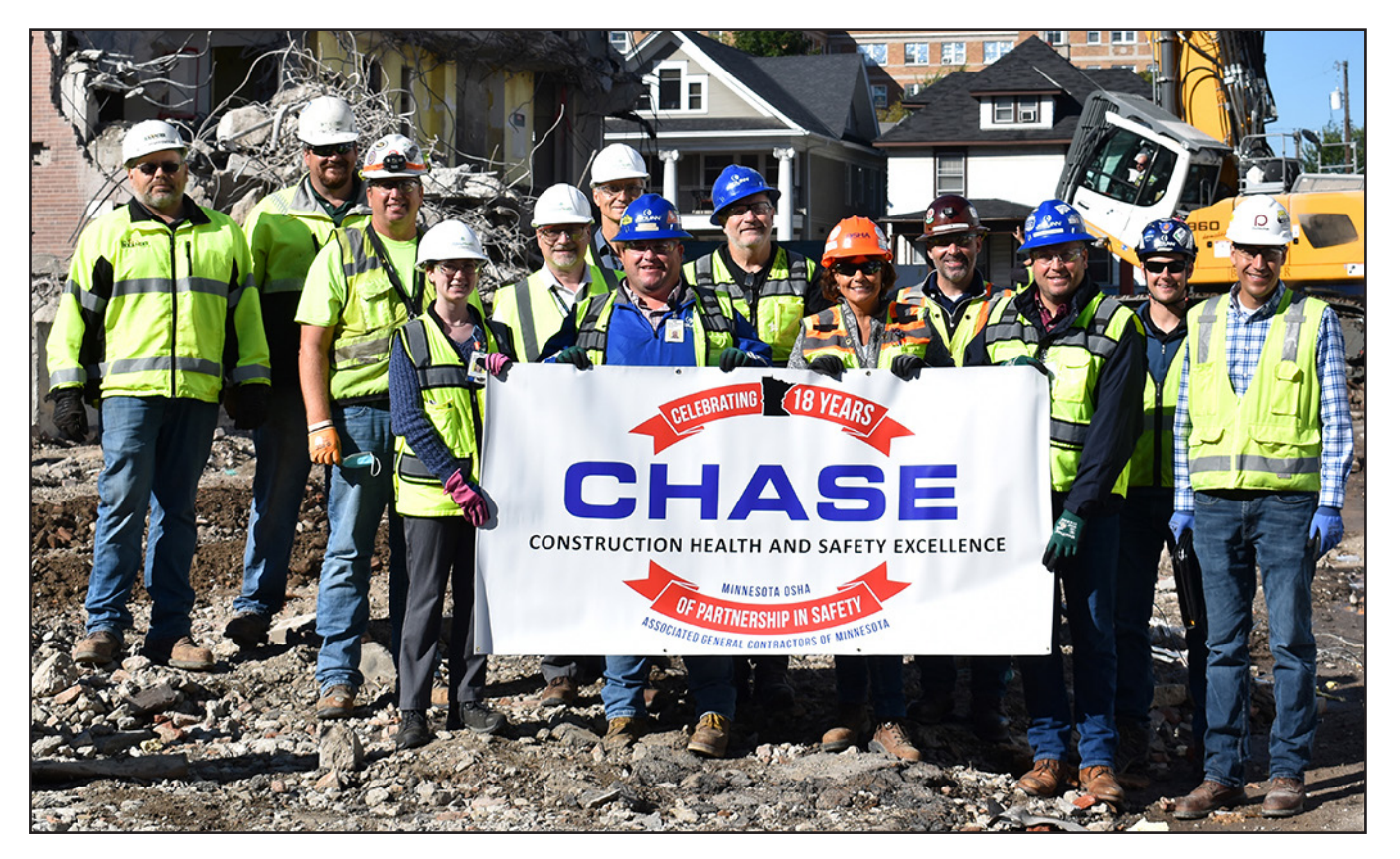
Carl Bolander and Sons, J.E. Dunn, Parsons Electric and Sowles Company • Abbott Northwestern Hospital, Central Utility Plant • Minneapolis

The partnerships acknowledge the importance of providing a safe, healthful work environment in construction and seek a working relationship that creates mutual trust and respect among all parties – including project owners and construction workers – involved in the construction process. Participants may achieve three award levels: basic, intermediate and peak.