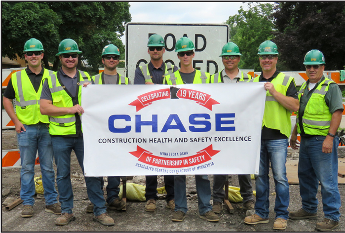
VEIT • Bryant Avenue Reconstruction • Minneapolis