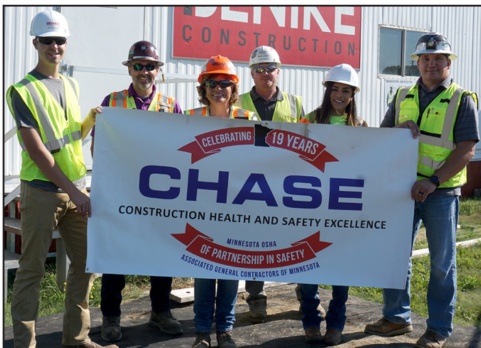
Benike Construction • F&M Bank • Rochester, Minnesota