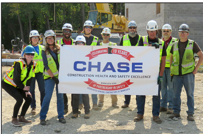
Mortenson Company • Blake School Early Learning Center • Hopkins, Minnesota