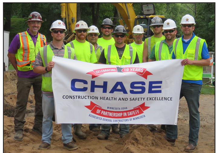
Meyer Contracting • North Shore Circle Street Improvement • Forest Lake, Minnesota