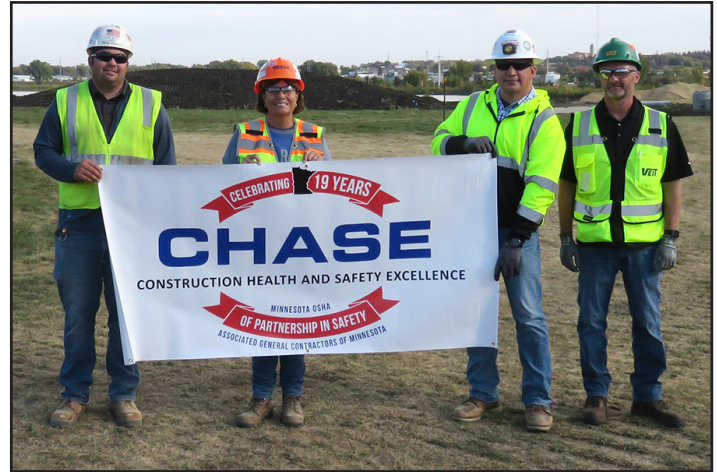
VEIT • Cascade Lake Park Improvement • Rochester, Minnesota