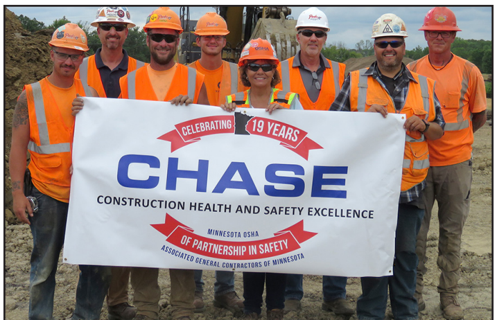
Park Construction Company • Evanswood Street and Utility Improvement, Phase 1 • Maple Grove, Minnesota