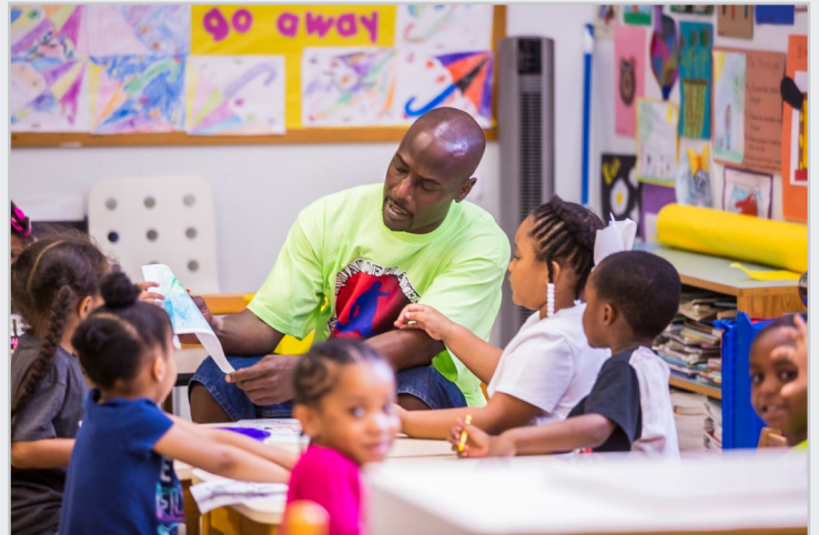
Child Care Aware of Minnesota is offering a two-year registered apprenticeship program for the child care industry.