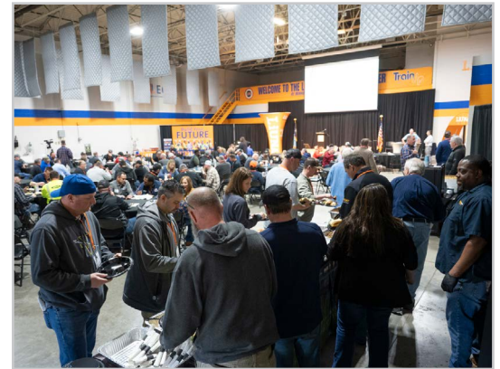
Left to right, laborers with giveaway prizes, the winner of an all-terrain vehicle and attendees of the contractor open house.