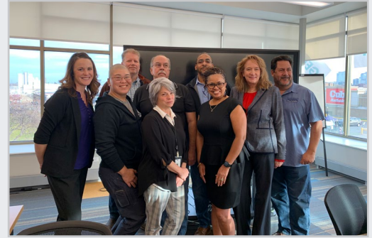
Partners in the new Office of Apprenticeship Outreach during an event on Nov. 14, 2023.

Apprenticeships are available in multiple, high-demand industries across the state. For more information, visit careerforcemn.com/careerforce-blog/announcing-minneapolis-apprenticeship-outreach-office .