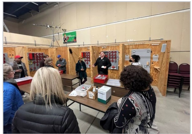
Statewide Limited Energy JATC