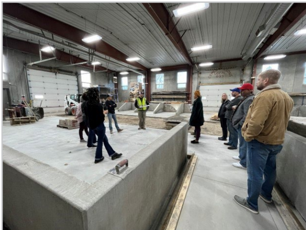
Cement Masons Training Center