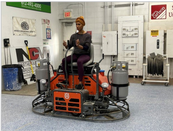
Cement Masons Training Center

In December, the Carpenters Training Institute provided Apprenticeship Minnesota staff with tours of their Twin Cities campuses (Twin Cities Campus, LJ Shosten Campus and the Floor Covers Training Center). Thank you to all the staff at these training centers for providing tours.