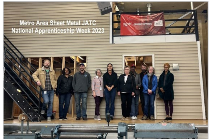
Metro Sheet Metal Workers Local 10 JATC