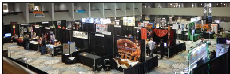
Trade show at the annual convention.

Staff met with carnival owners, inflatable operations, circuses, food vendors and fair board members.