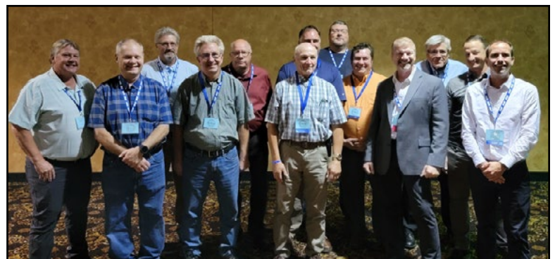
Electrical area representatives and staff at the IAEI Western Section meeting.

The Western Section is the largest of six IAEI sections, and includes 17 states across the center United States. Minnesota's electrical area representatives have been very active in the 2023 NEC code making process and submitted many proposals that were accepted by the code panels.